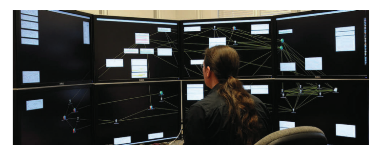
Fig. 4: Space to think: An analyst is immersed in a large sensemaking space, organizing a schema of textual data in collaboration with machine learning algorithms [2, 4].

A key challenge is designing immersive interactions that provide relevant input to computational analytics and designing computational analytics that appropriately support such user feedback [35]. One of the principles of Semantic Interaction [18] is to exploit existing cognitive operations that sensemakers naturally apply in physical environments, such as organizing and annotating, and re-casting these cognitive-level interactions into low-level feedback required by computational algorithms. Since these interactions are likely to be incremental in nature, it is important that the algorithms are designed such that they (1) do not require complete specification of all parameters up front, and (2) support incremental model learning [49].