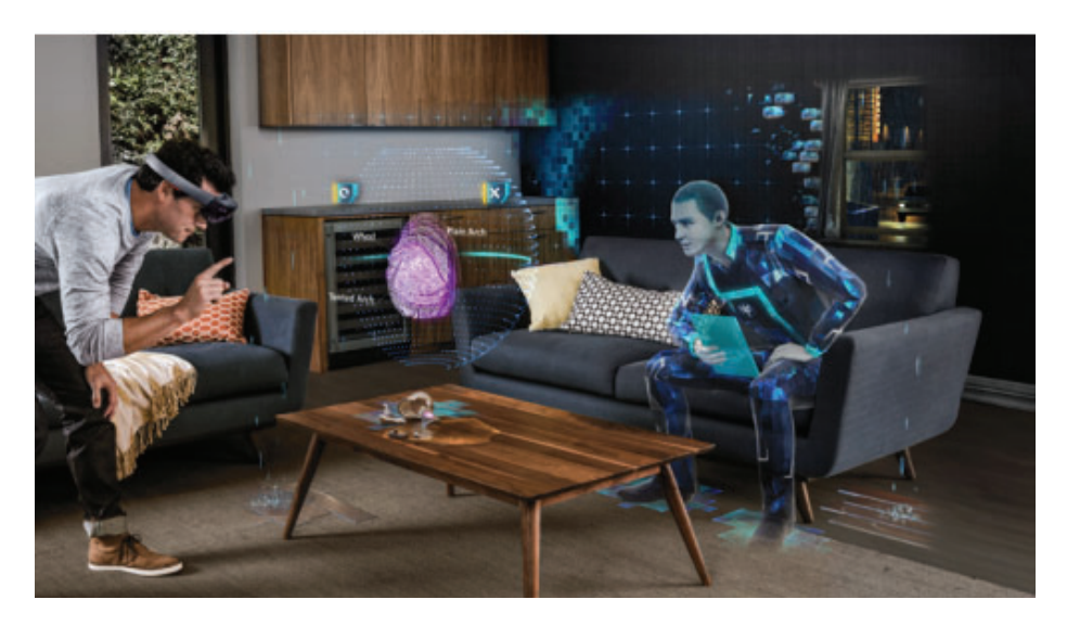
Fig. 1: The Hololens Fragments game allows deeper exploration of a scene using alternate 'lenses'.